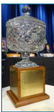
Media Persons of the Year Trophy