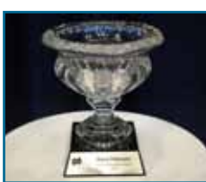
Lifetime Achievement Award