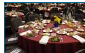
Table settings in the Atrium of the Edward Jones Headquarters