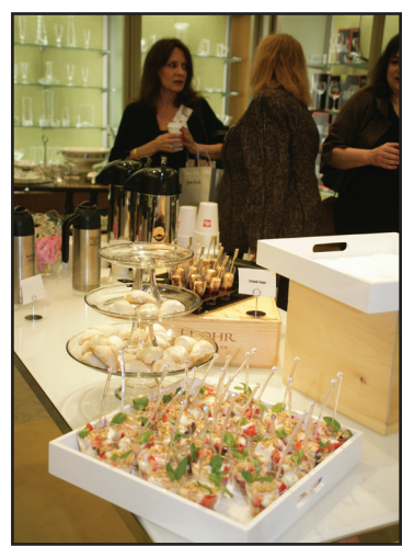
Beauty Buzz brunch buffet

Light brunch bites and mimosas from the N-M Zodiac Room and wines by Adam Puchta Winery greeted guests as they arrived and then flowed through six instructional beauty bars. Sharing their tricks of the trade were cosmetic and skincare experts from Laura Mercier, Trish McEvoy,